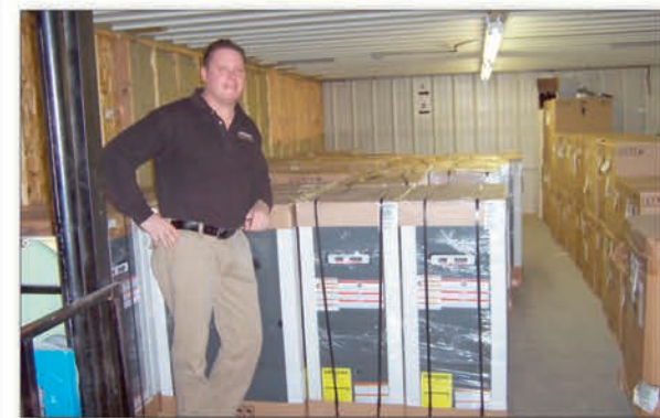
* With Approved Credit. Ask for details. ** With High Efficiency upgrade.